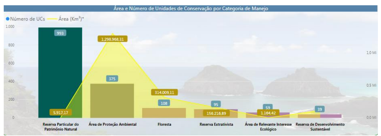
Figure 01. Area and number of Conservation Units per management category