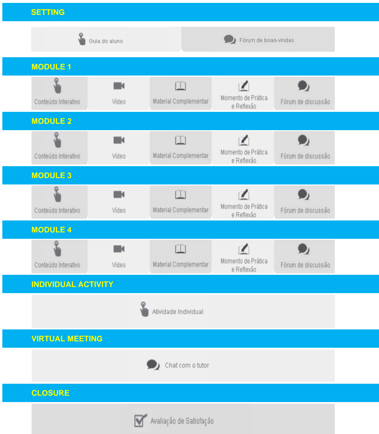
Fig. 2 Structure for Moodle's virtual learning environment.

Complementary material: material that complements the content from the modules and has technical-scientific texts, a list of websites for research and links for content available online.